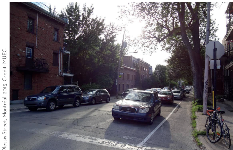
Plessis Street, Montréal, 2015.

When considering traffic calming measures, Canadian municipalities must remain mindful of winter conditions. On one hand, they worry that snow-clearing operations may be complicated by the presence of certain road design features; on the other, city equipment may damage these features as they move through the community. However, an inquiry among local municipalities led by the ministère des Transports du Québec revealed that snow-clearing operations posed no threat to traffic calming features if the features are properly designed, the clearing operations are appropriately adapted, and equipment operators undergo training. 8 Municipal authorities may also opt to install temporary design features, which can be removed before winter.