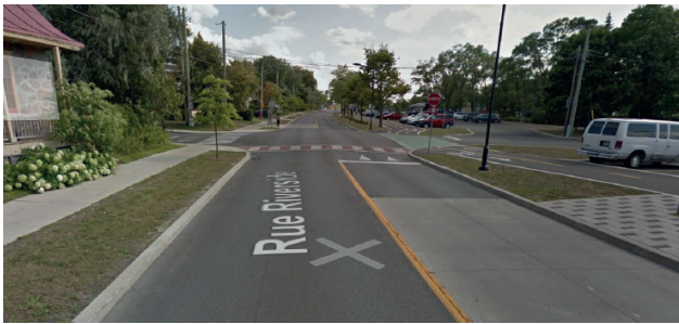
Intersection of Riverside and Pine Streets, Saint-Lambert

A corridor along Riverside Street and its nearby intersection with Pine Street were redeveloped and made more attractive and safe through various traffic calming measures. This project was part of the vision and prime directive of the Saint-Lambert Traffic Master Plan (2013). 9 The City took advantage of reconstruction work on underground infrastructures to complete the Riverside Street redesign. Riverside Street is a main collector with several bus routes.