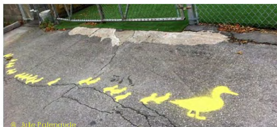
Projet : Ruelle Mile-E

L'ajout de peinture, de pancartes et de mesures pour ralentir la circulation et sensibiliser les usagers de la route aux besoins des plus vulnérables représentent des options valables dans le cadre de ce projet. Ces réalisations doivent néanmoins être autorisées par les autorités de votre arrondissement ou de votre ville.