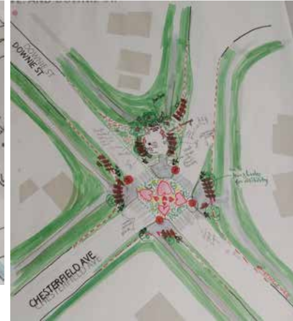
CHESTERFIELD AVE. & DOWNIE ST.