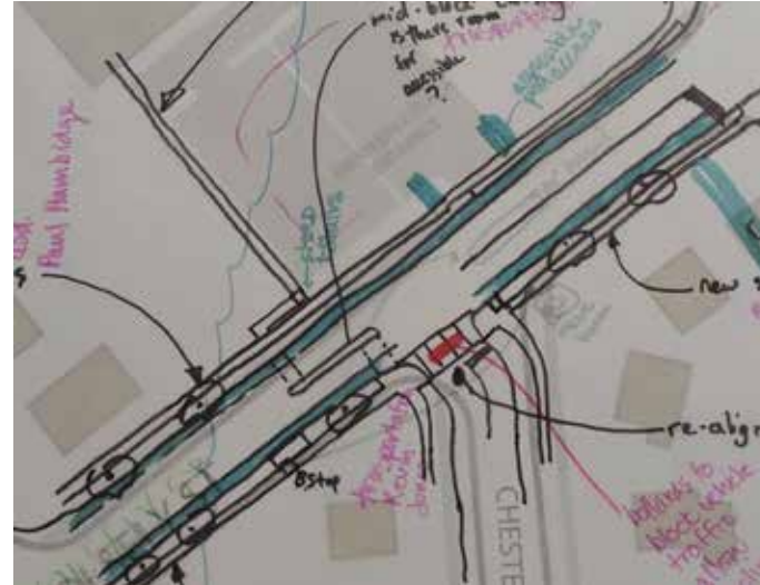
WOLSELY ST. & CHESTERFIELD AVE.