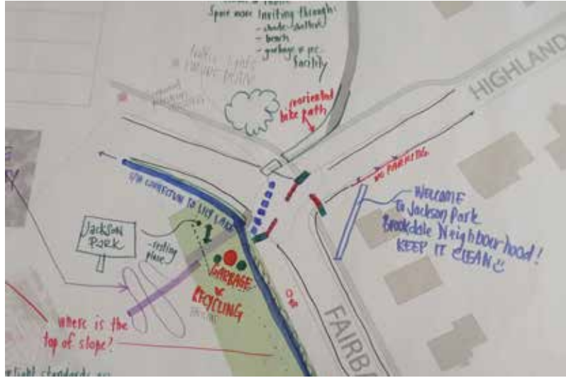
HIGHLAND RD. & FAIRBAIRN ST.